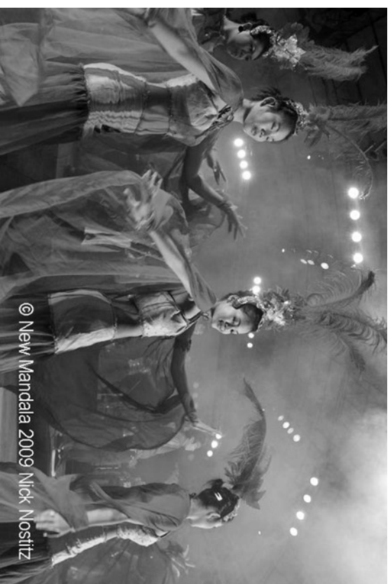
Figure 3. Red shirt hang khruang (dance revue). Photo by Nick Nostitz. Used with permission.

‘Since the day you left the villagers have been waiting intensely For you to come back to heal the poor.’